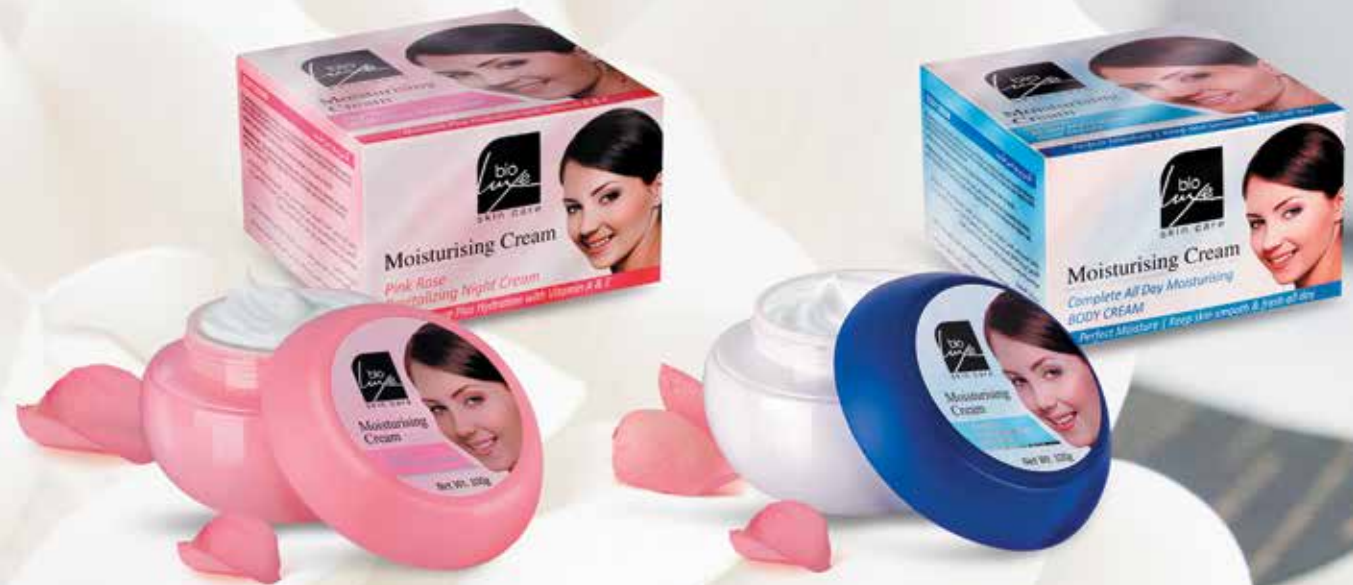
Moisturizing Cream Pink Rose 100g