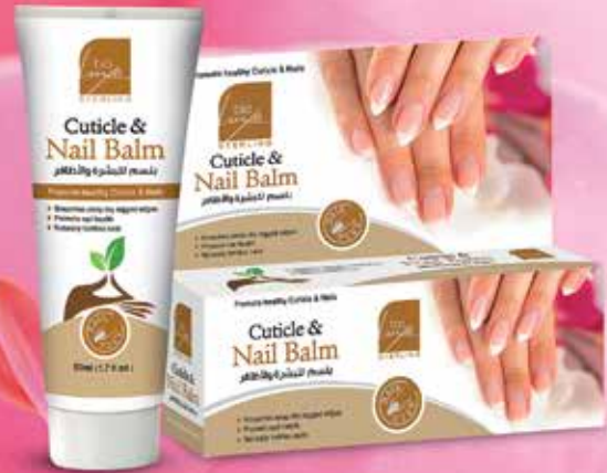
Cuticle & Nail Balm