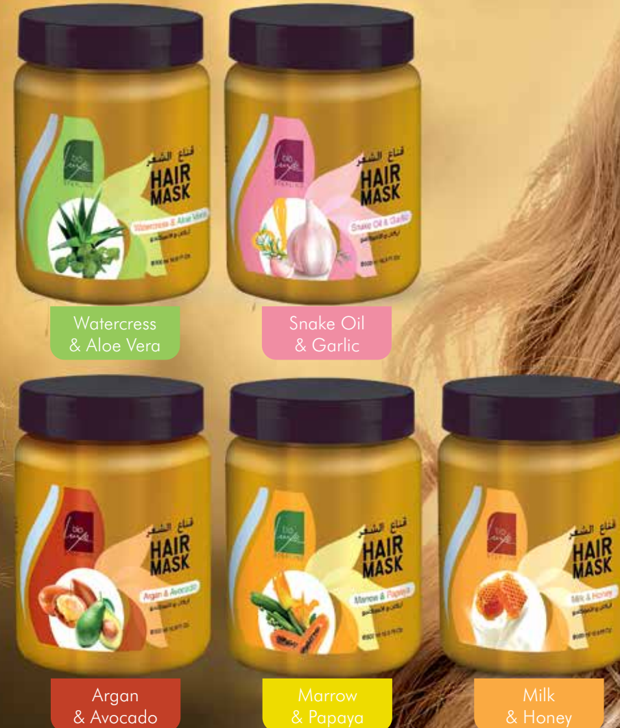
Watercress & Aloe Vera