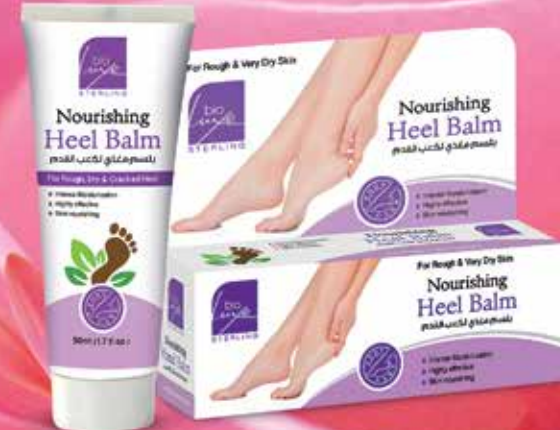
Nourishing Heel Balm