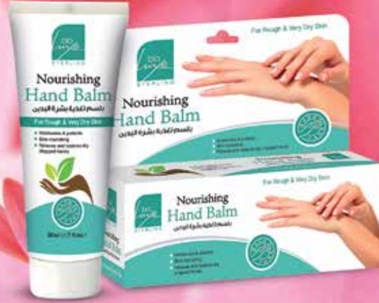
Nourishing Hand Balm