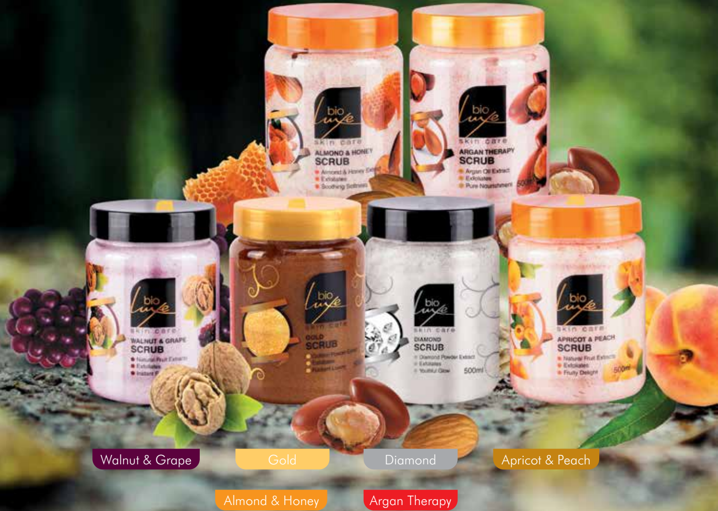
Walnut & Grape