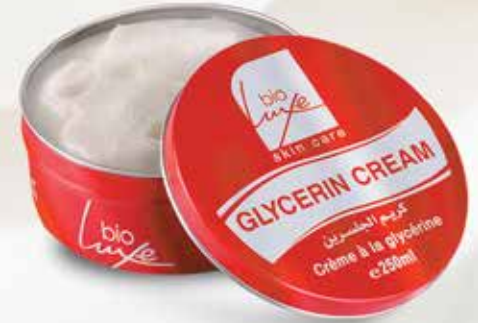
Glycerin Cream 250ml