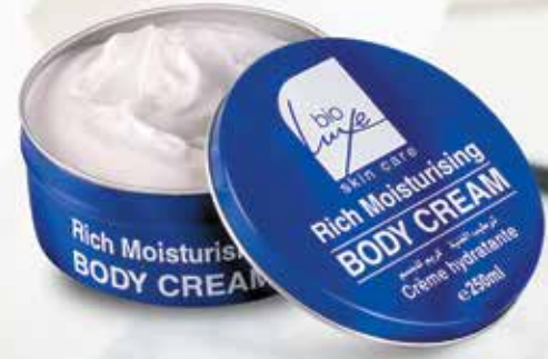
Rich Moisturizing Body Cream 250ml