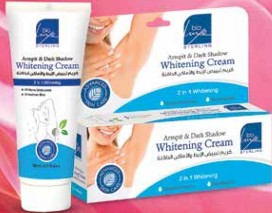
Armpit & DarkShadow