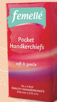
Pocket Handkerchiefs 3 Ply Pocket, 4 Ply Pocket (Pkg/ Ctn: Dz30)