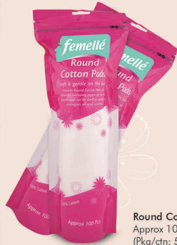
Round Cotton Pads Approx 100 Pcs (Pkg/ctn: 50pcs)