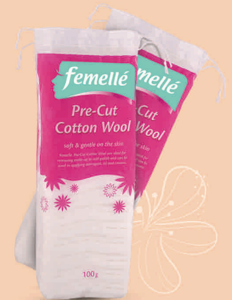
Pre-Cut Cotton Wool Approx 100g (Pkg/ctn: Dz05)