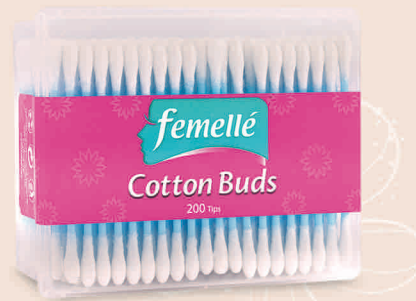
Cotton Buds 200s Rectangle Box (Pkg/ctn: Dz10)