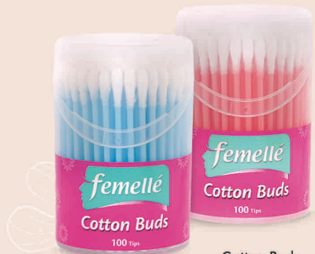
Cotton Buds 100s Flip Top Box (Pkg/ctn: Dz10)