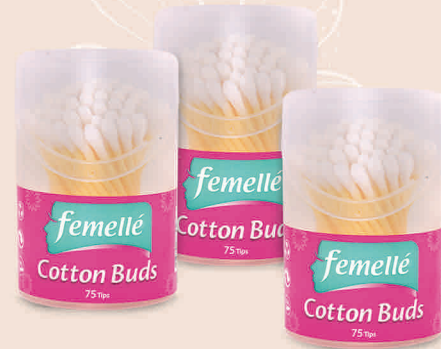
Cotton Buds 75s Flip Top Box (Pkg/ctn: Dz10)