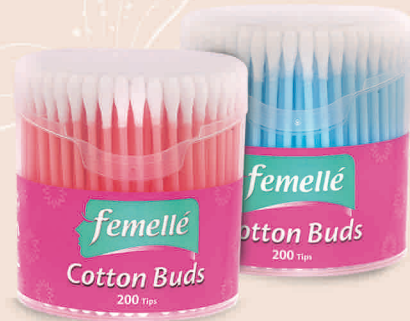
Cotton Buds 200s Flip Top Box (Pkg/ctn: Dz10)