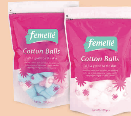
Colour & White Cotton Balls Approx 100 Pcs (Pkg/ctn: Dz04)