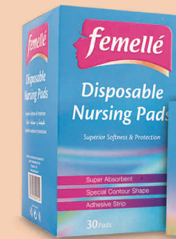
Disposable Nursing Pads 30 Pads (Pkg/ctn: Dz01)