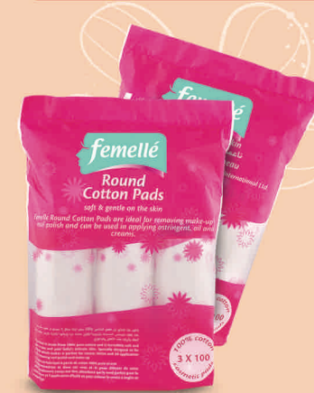
Round Cotton Pads Value Pack 3 x 100 Pcs Approx (Pkg/ctn: 20pcs)